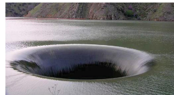
Precedent image of Nautilus Pond™ draining system