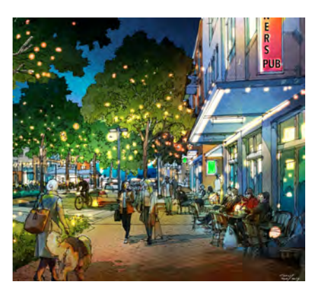
A unique blend of residential and commercial frontage, Nimbus Way provides the opportunity for urban markets and pop up community events