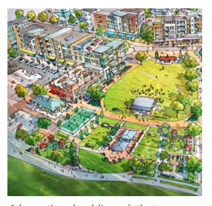
A large tiered public park that provides for a variety of active and passive activities adjacent to the escarpment and the regional network