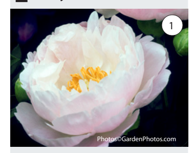
8 Snow Pavement Rose