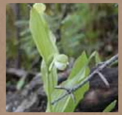
ABOVE: Sparrow's-egg Lady's-slipper (Cypripedium passerinum) On the cover: Northern Green Bog Orchid (Platanthera hyperborea,