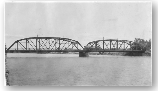
Calgary Bow River, Langevin Bridge [9]

separating them in the way proposed, they acquire the habits and tastes...of civilized people." (CBC Calgary, June 16, 2015) For The City of Calgary to consider re-naming the bridge to a name that signifies building communities rather than dismantling them is a powerful symbol of mutual respect for the future.