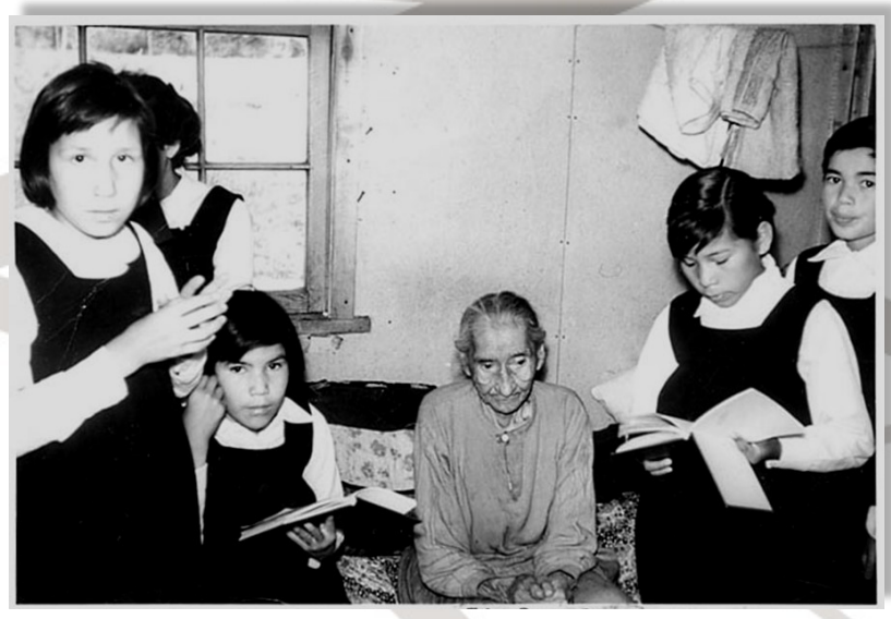
'Explorers' from Norway House School holding service in the home of a community member, 1959