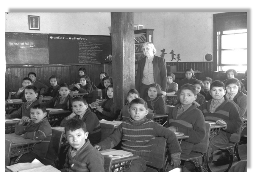
'Thou shalt not tell lies' written on blackboard (school and date unknown)