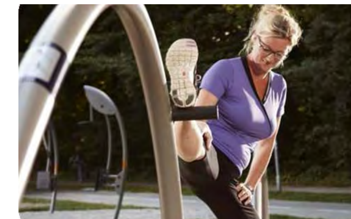
3. Stretch & Sit-ups