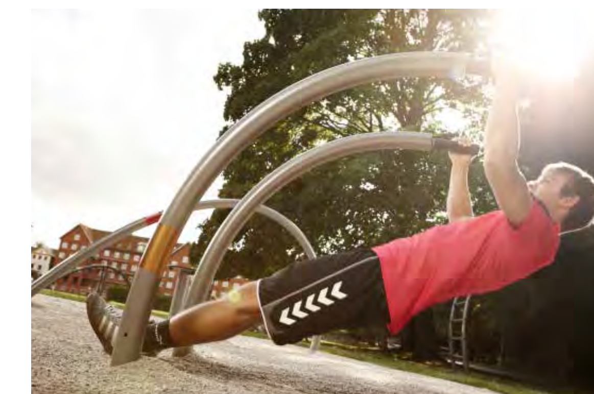
4. Bar & Bench