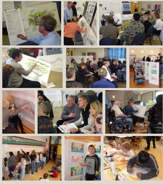
Many Calgarians have already had an opportunity to participate in this project

The landscape of the Memorial Drive corridor is also experientialinviting Calgarians to experience the poetics of the wind on the grass, the movement of water, the dance of city lights.