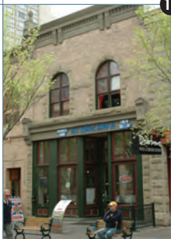
CALGARY'S NATIONAL HISTORIC DISTRICT STEPHEN AVENUE