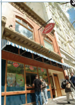
CALGARY'S NATIONAL HISTORIC DISTRICT STEPHEN AVENUE