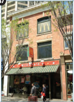
CALGARY'S NATIONAL HISTORIC DISTRICT STEPHEN AVENUE