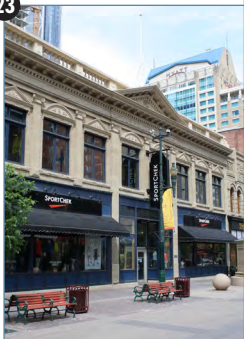
CALGARY'S NATIONAL HISTORIC DISTRICT STEPHEN AVENUE