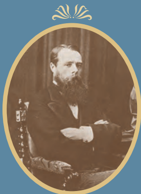
Lord George Mount Stephen

Named after the first Canadian Pacific Railway president, Lord George Mount Stephen, the Avenue was Calgary's main commercial street starting with the coming of the railway in 1883. As the text from the plaque inscribed by the Historic Sites and Monuments Board of Canada reads: