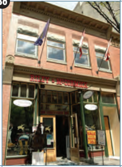
CALGARY'S NATIONAL HISTORIC DISTRICT STEPHEN AVENUE