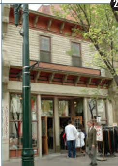
CALGARY'S NATIONAL HISTORIC DISTRICT ⌘STEPHEN AVENUE⌘