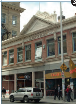
CALGARY'S NATIONAL HISTORIC DISTRICT STEPHEN AVENUE