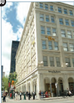
CALGARY'S NATIONAL HISTORIC DISTRICT STEPHEN AVENUE