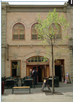
CALGARY'S NATIONAL HISTORIC DISTRICT STEPHEN AVENUE