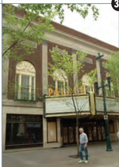
CALGARY'S NATIONAL HISTORIC DISTRICT STEPHEN AVENUE