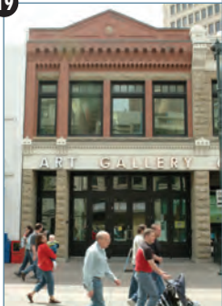
CALGARY'S NATIONAL HISTORIC DISTRICT STEPHEN AVENUE