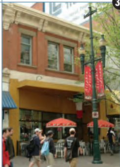
CALGARY'S NATIONAL HISTORIC DISTRICT STEPHEN AVENUE