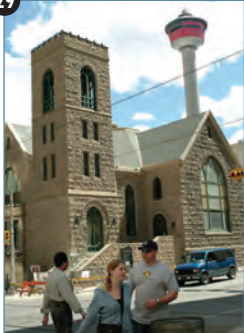
CALGARY'S NATIONAL HISTORIC DISTRICT STEPHEN AVENUE