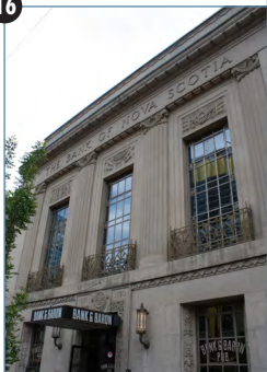
CALGARY'S NATIONAL HISTORIC DISTRICT STEPHEN AVENUE