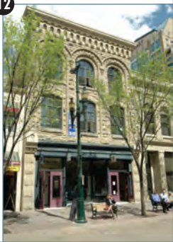
CALGARY'S NATIONAL HISTORIC DISTRICT STEPHEN AVENUE