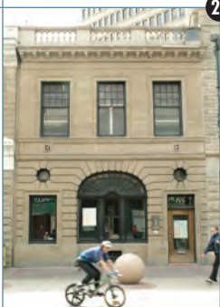
CALGARY'S NATIONAL HISTORIC DISTRICT STEPHEN AVENUE