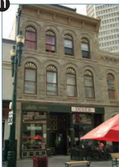
CALGARY'S NATIONAL HISTORIC DISTRICT STEPHEN AVENUE