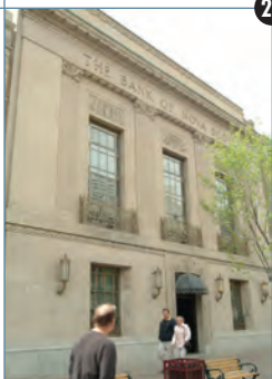
CALGARY'S NATIONAL HISTORIC DISTRICT ⌘STEPHEN AVENUE⌘