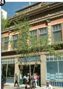
CALGARY'S NATIONAL HISTORIC DISTRICT STEPHEN AVENUE