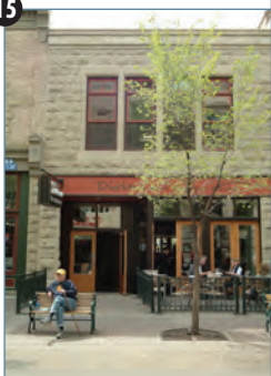
CALGARY'S NATIONAL HISTORIC DISTRICT STEPHEN AVENUE