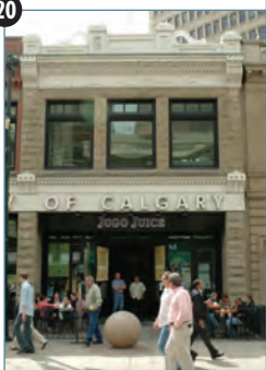
CALGARY'S NATIONAL HISTORIC DISTRICT STEPHEN AVENUE