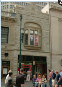
CALGARY'S NATIONAL HISTORIC DISTRICT STEPHEN AVENUE