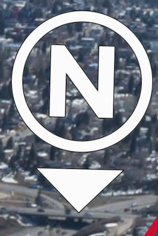
Widening and re-enforcing of the Bow River Bridge piers