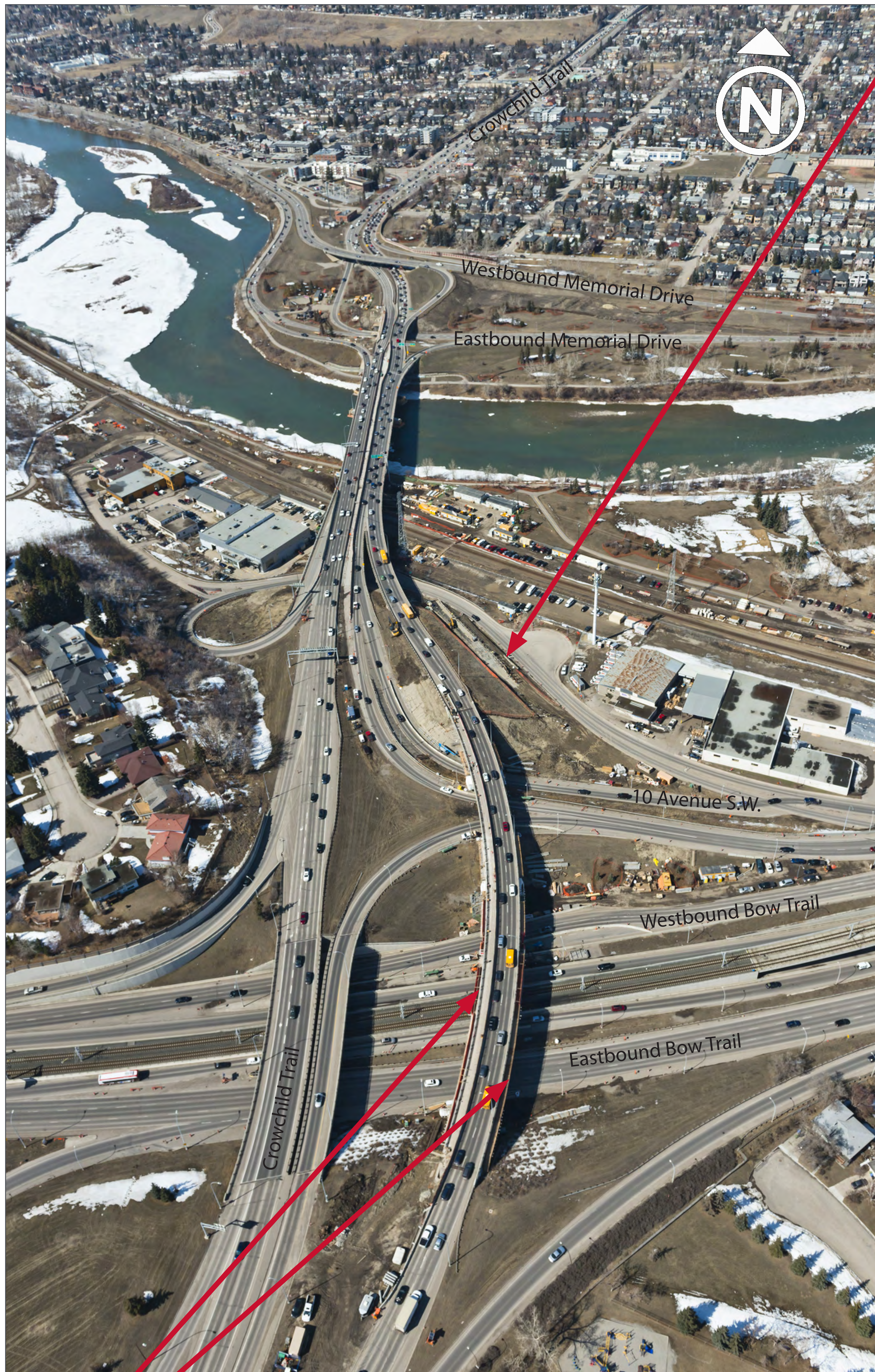
Retaining wall being built for new Bow Trail and 10 Avenue S.W. on-ramps