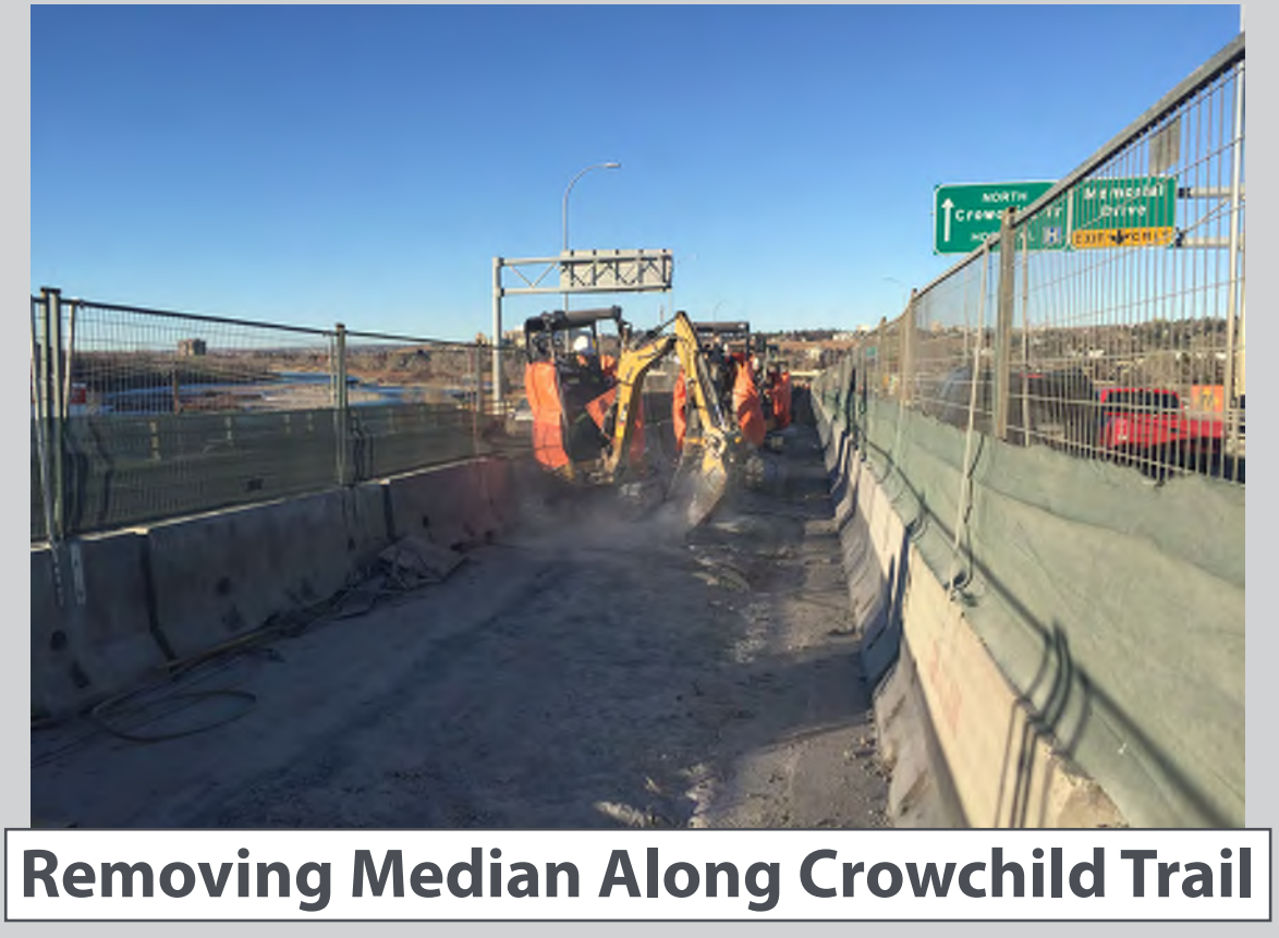
Removing Median Along Crowchild Trail