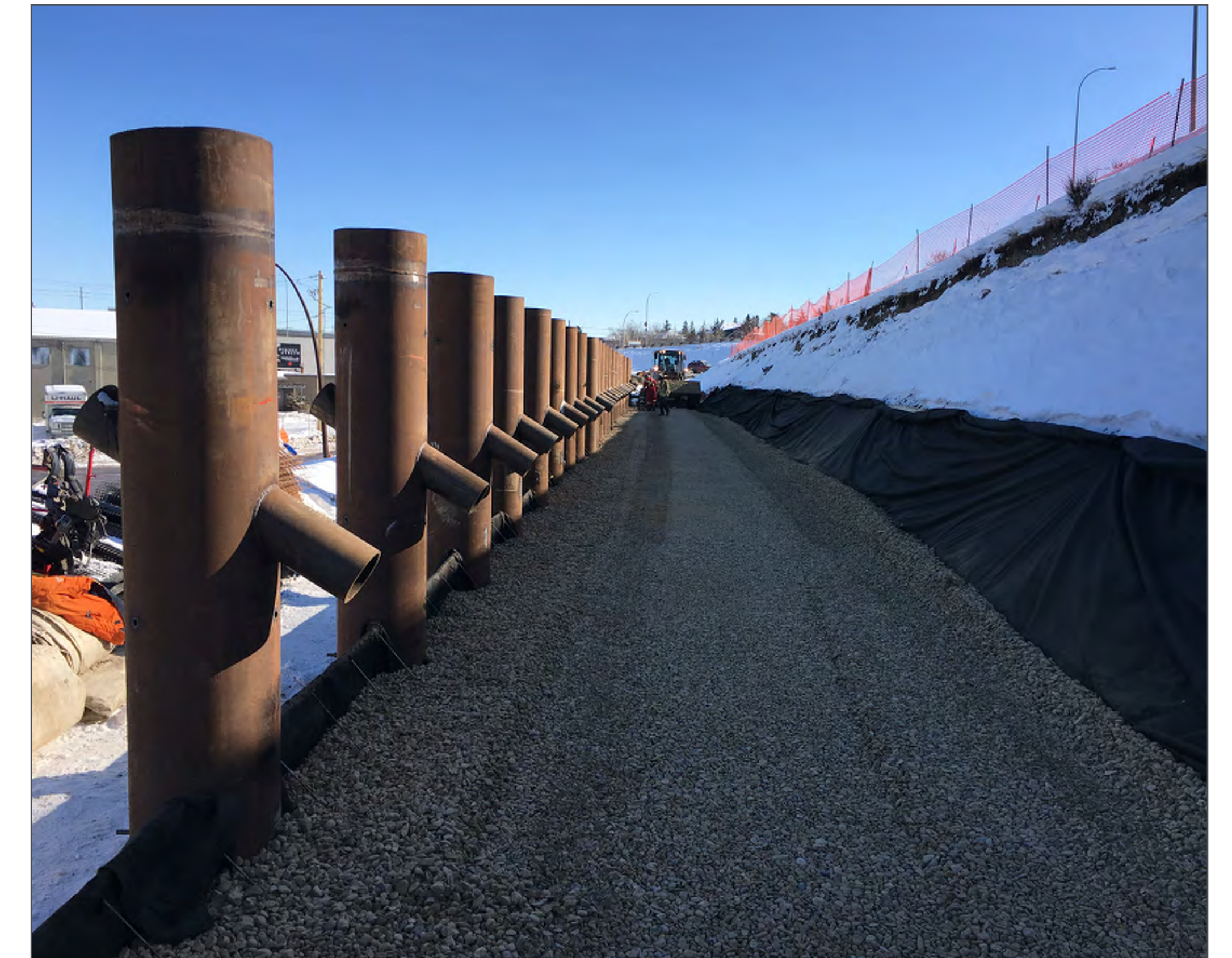
Widening of Bow Trail Bridge, including the installation of work platforms