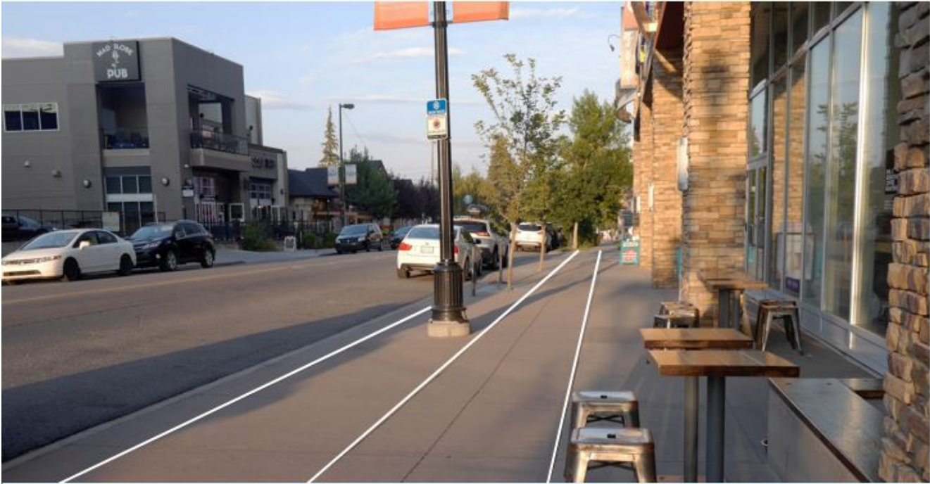
Figure 1.2 Public Realm Components and Zones on 33 Avenue SW