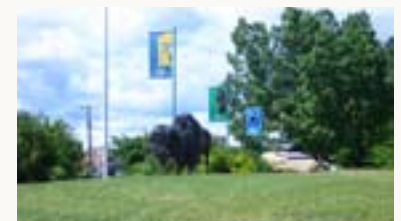
Statue near Ninth Avenue Bridge