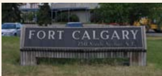
Sign at front entrance on Ninth Avenue S.E.

An archaeological dig in 1970 turned up hundreds of artifacts. Many are on display at the Fort.