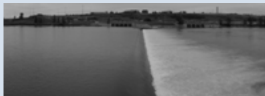
Weir on the Bow River

In 1929, the son of Calgary settler Colonel James Walker applied to the federal government to have 59 acres on the west side of the Bow River designated a migratory bird sanctuary. His request was granted and the Inglewood Bird Sanctuary has been dedicated to bird conservation ever since. During your visit, you will encounter dozens of different bird species. You might want to bring a pair of binoculars. You can also peek at the live action on the lagoon using the Ducks Unlimited Canada remote control camera.