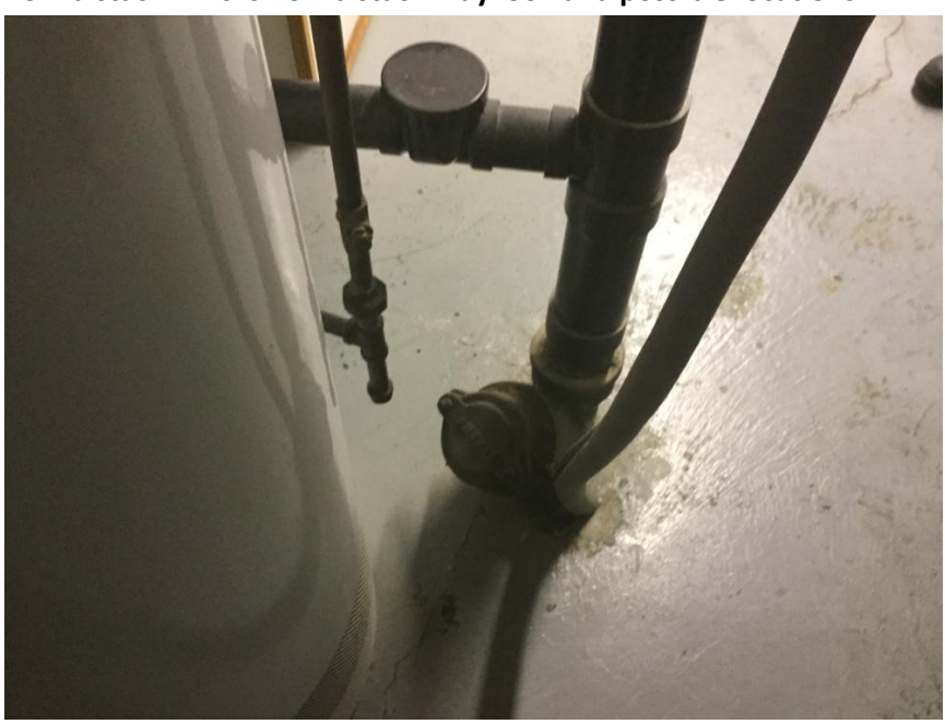
Figure 5: Sometimes this type of stack can be used, but in the interest of protecting your property from damage Water Services crews prefer to work from the cleanout.

If the cleanout cannot be located in the floor, then it may be possible for our crew to work from a stack. This is how a stack may look and possible locations.