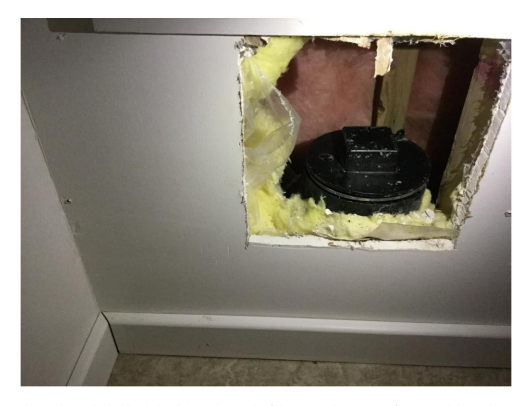
Figure 7: The stack may be hidden behind drywall or under fillings. It is the customer's responsibility to locate and expose it. Relieving a choke from a stack is difficult; Water Services crew will determine the feasibility of doing so.