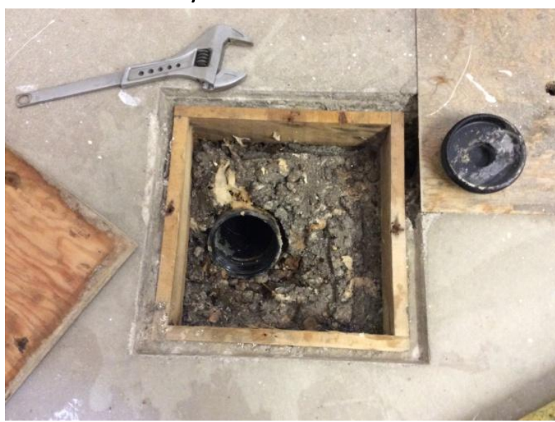
Figure 1 Cleanout in the floor