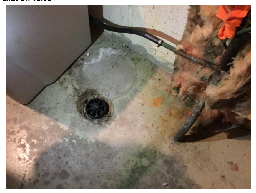
Figure 4: The cleanout may be in close proximity of the entrance of the water line as shown here

Look to see where the water service comes into the house. Both water and sanitary enter the house in the same location. You may find the cleanout in close proximity to the main water shut off valve