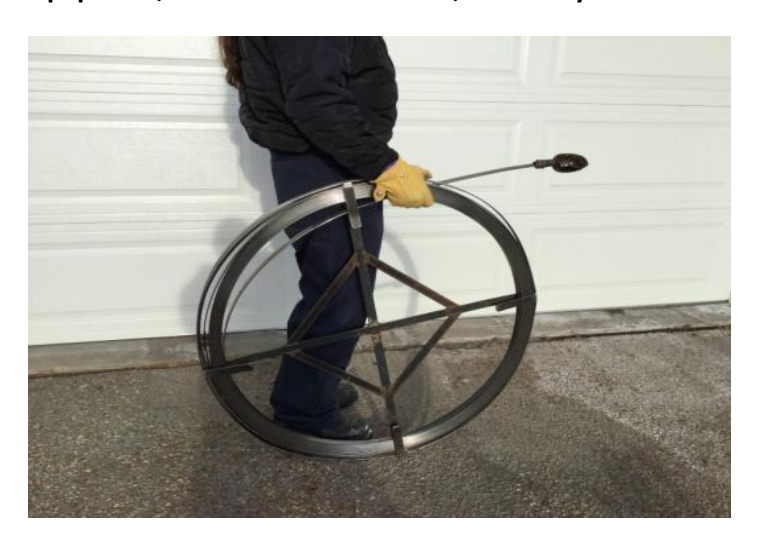
Figure 8: Water Services crew member displays the steel snake, a long coiled cable that is used to remove blockages.