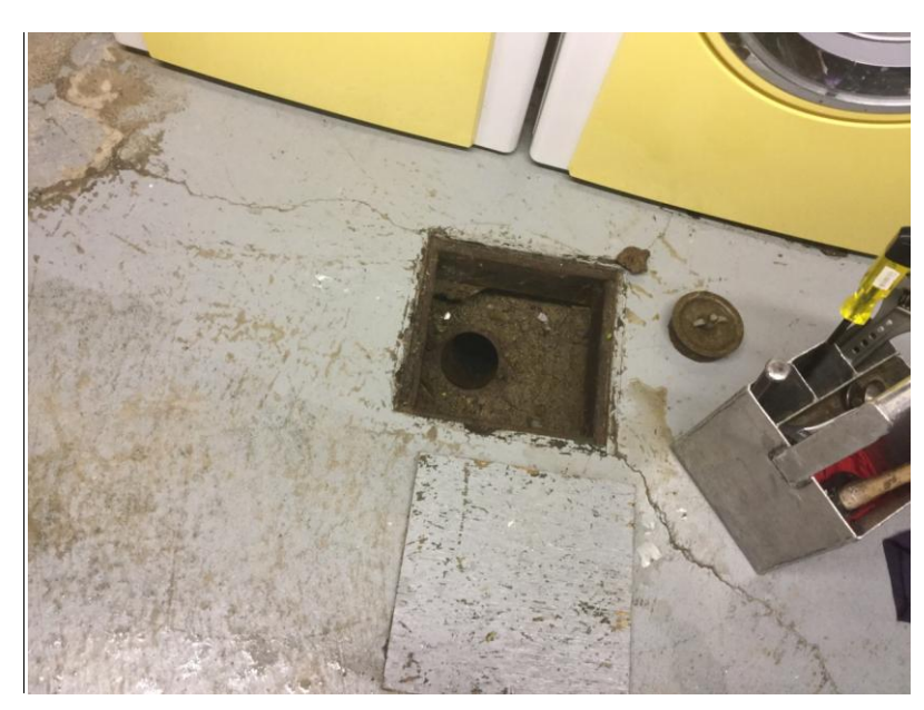
Figure 2: Cleanout