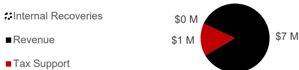
City Cemeteries 2022 Budgeted Gross Operating Expenditures Funding Breakdown ($ Millions)

Note: Internal recoveries is how The City accounts for the costs of goods or services between services