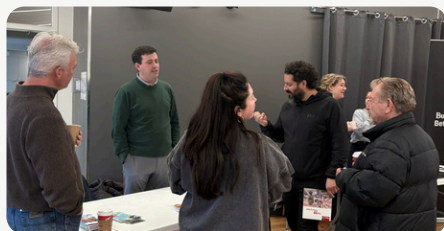
Engaging with residents at an Open house hosted by Willowridge Community Association