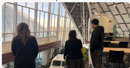
Tour of Fish Creek Library