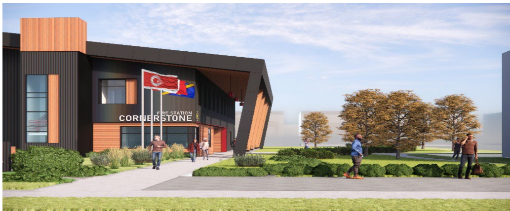
Cornerstone Fire Station