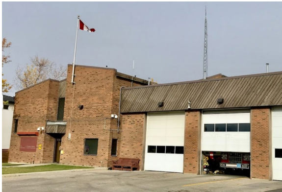
Fire Station 8