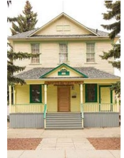
Capitol Hill Cottage School