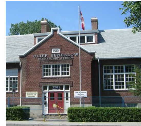
Cliff Bungalow School