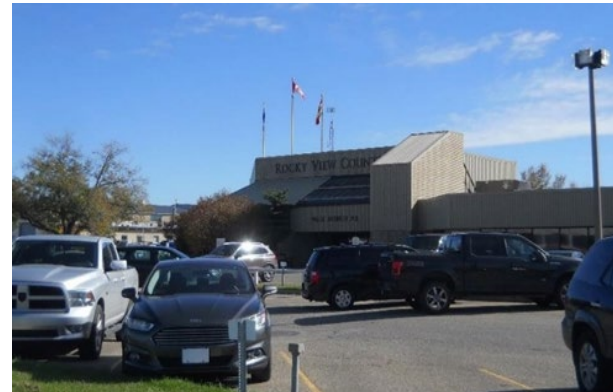
South Spring Gardens Demo