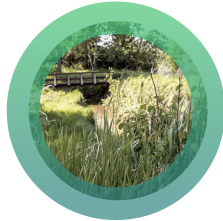
FINANCIAL & ENVIRONMENTAL STEWARDSHIP