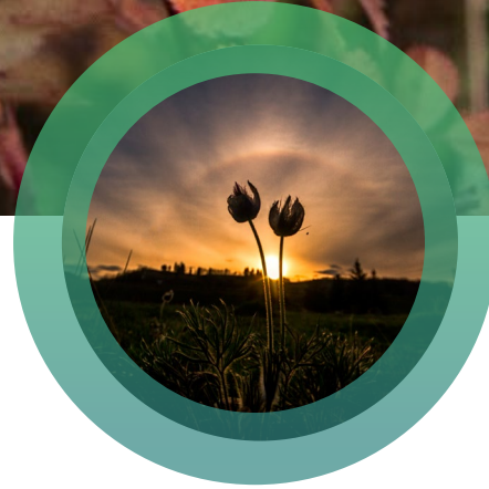
OPEN SPACES & NATURAL AREAS