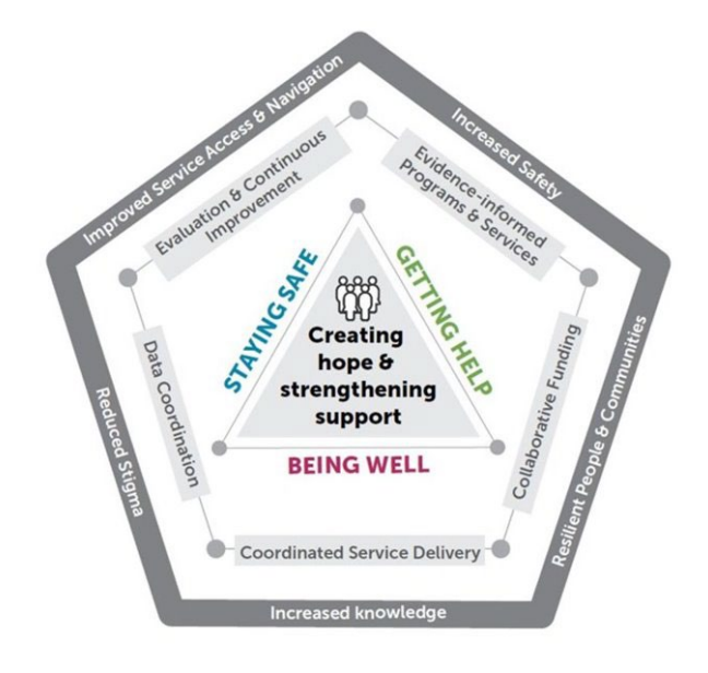
Figure 2: Strategic framework

Getting Help: What you need, when, where and how you need it. Staying Safe: Security at all times, especially in a crisis.