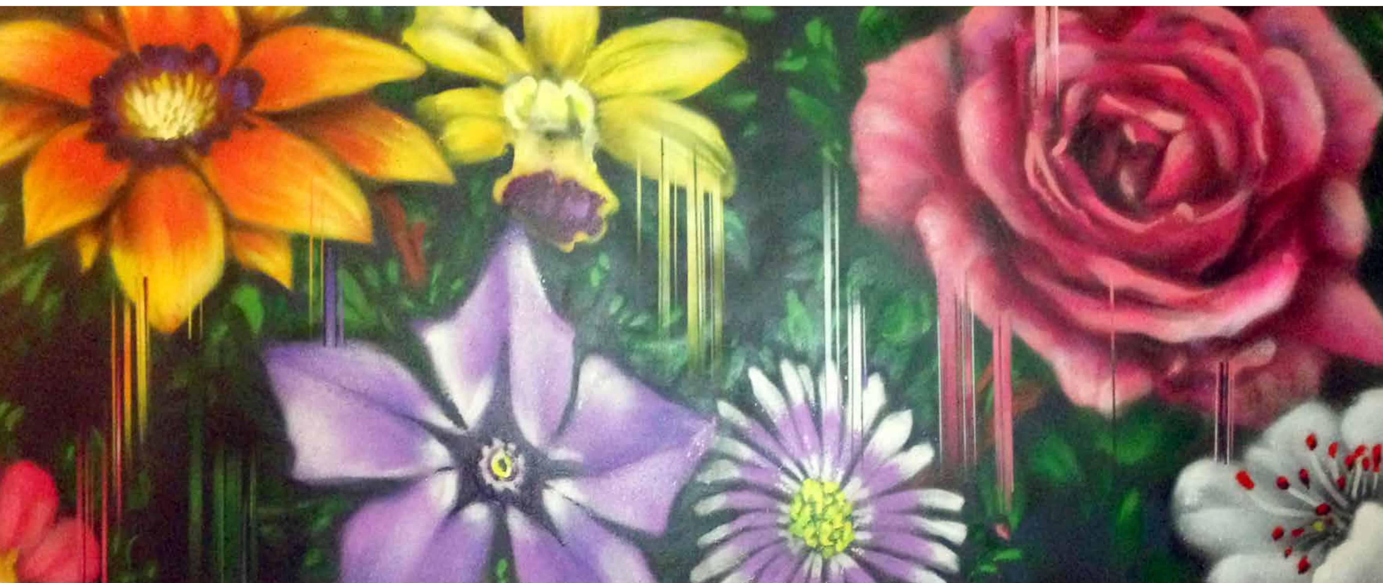
Example of mural artwork: Flowers for Aeron by AJA Loudon, 2016 lead artist for The City of Calgary Painted City Street Art Program for Youth

For more information please visit calgary.ca/streetart