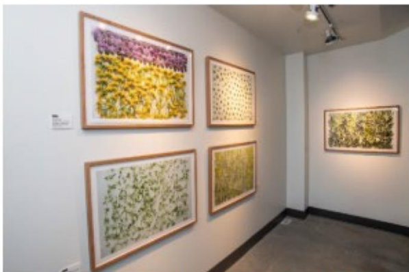
Essential Oils (for Alberta) exhibition at Open Spaces.