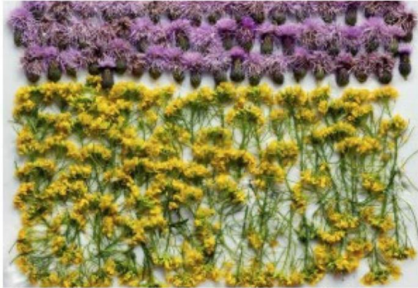
Alana Bartol, Enfleurage: Thistle and Wild Mustard (Hillhurst Sunnyside, Downtown West), 2016, colour photograph on paper.

enfleurage process. She used botanical (and other materials such as coffee beans and socks) from both communities that were donated, purchased or foraged.