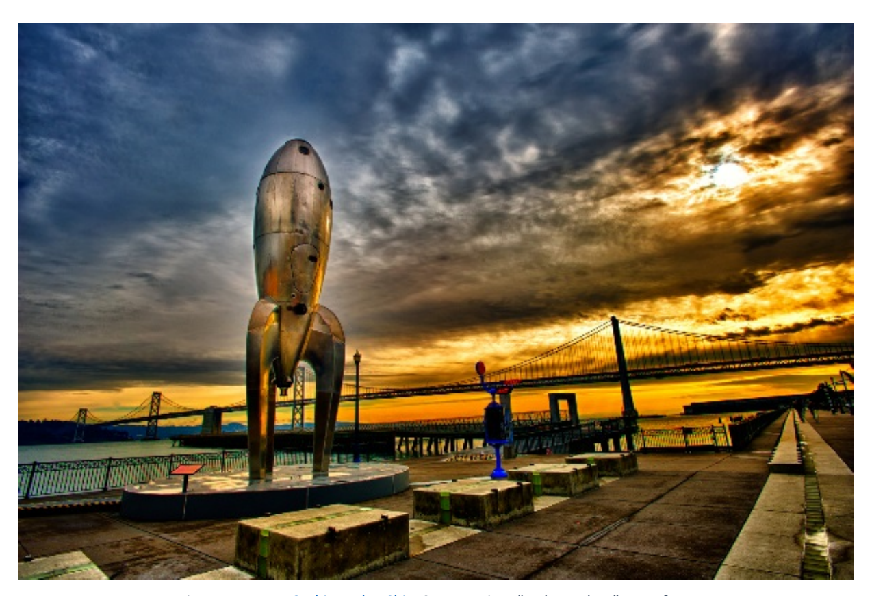
Figure 1 Raygun Gothic Rocket Ship, San Francisco "Embarcadero" waterfront