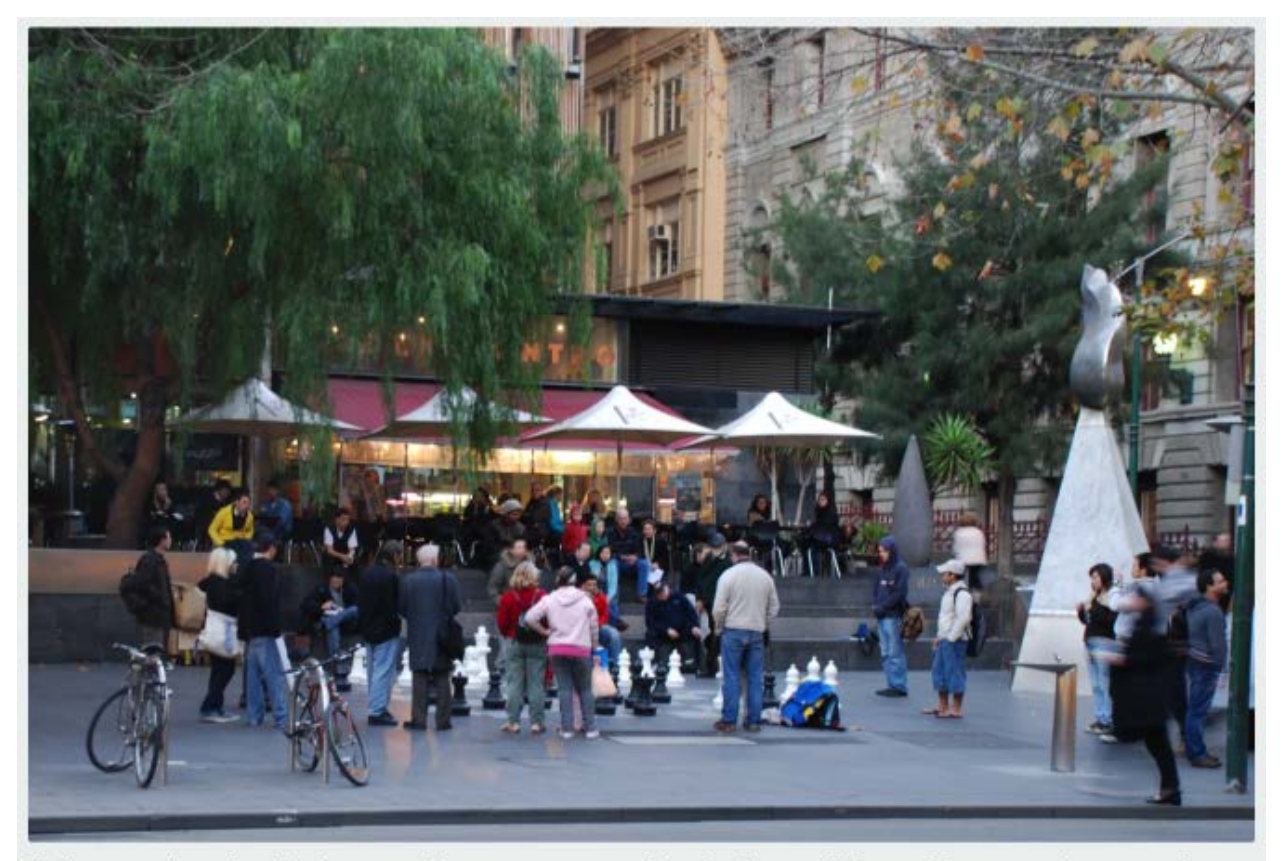
Melbourne, Australia. The layering of activities generated by the Power of 10+ model ensures that no single type of use or user dominates the space.

Culture and Activity Brief Workshop held 2019 May 2