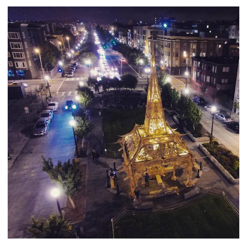
Figure 2 "Temple" at Patricia's Green, San Francisco

Culture and Activity Brief Workshop held 2019 May 2