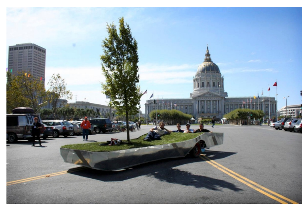
Figure 3 <u>Parkcycle by REBAR</u>, made its debut on Park(ing) Day 2007 in San Francisco.