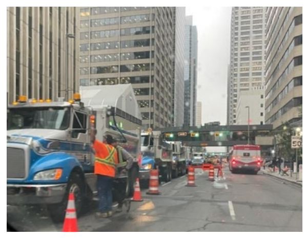
Looking east at Calgary District Heating Inc. pipeline relocation work along 5 Avenue S.W., west of 2 Street S.W.

The following tables summarize utility relocation works that continued throughout the month of August with a look ahead at planned construction activities for the month of September: