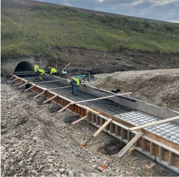
Looking south along the diversion track alignment.