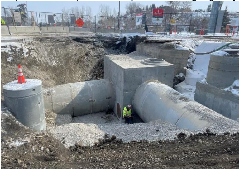
Looking southeast at manhole installation work at 12 Avenue and 6 Street S.E.

The pictures below provide a snapshot of the ongoing utility installation works.