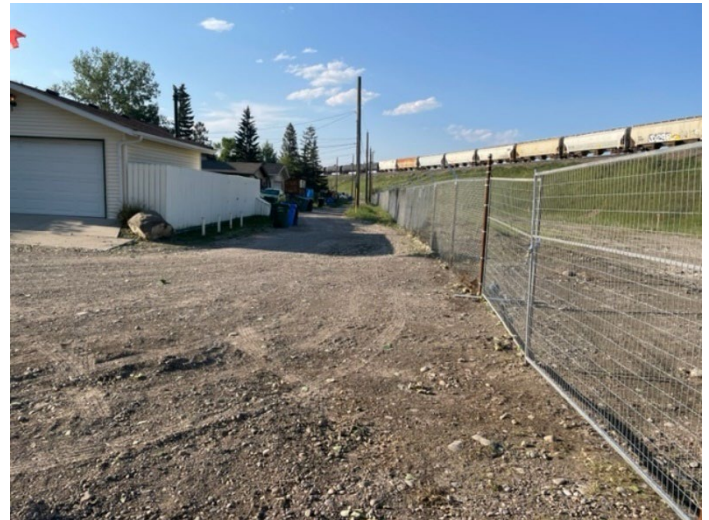
Looking north towards the safety fence installed between the work zone and residences.