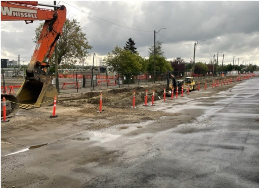
Looking east at deep utility relocation work along 12 Avenue S.E., east of 5 Street S.E.