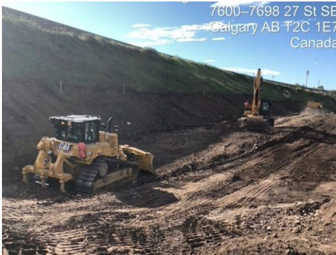
Looking East at the preparatory work to construct the 78 Avenue diversion embankment.

Construction began on July 26, 2023 with stripping and cleaning of a culvert prior to starting the critical construction of embankments for temporary diversion of freight tracks.