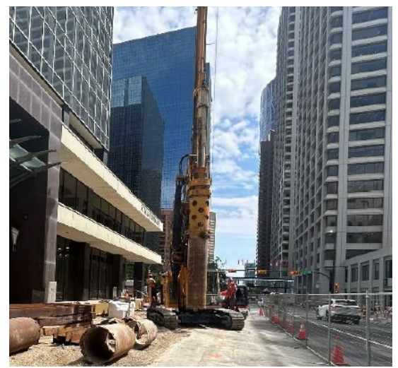
Looking west at deep utility relocation work on 12 Avenue S.E., west of 6 Street S.E.