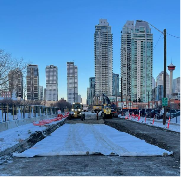
Next Month Look Ahead

As part of the procurement process, Green Line will continue to review requests for information and participate in meetings with the two pre-qualified proponent teams.