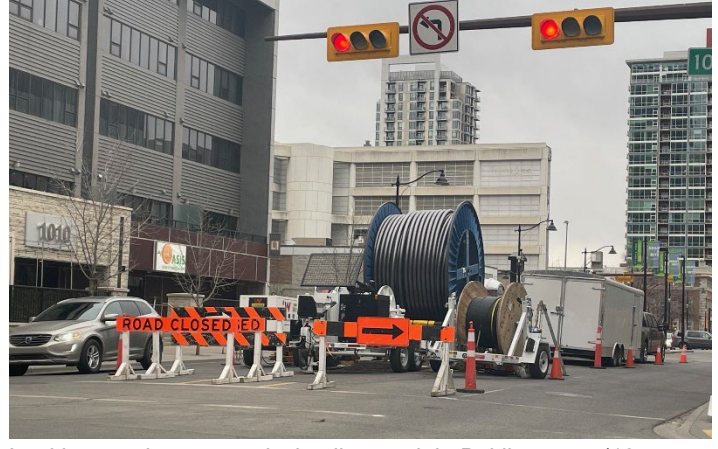
Looking south at transmission line work in Beltline west (10 Avenue).

Utility relocation work continued in the month of October within the Beltline and Downtown.