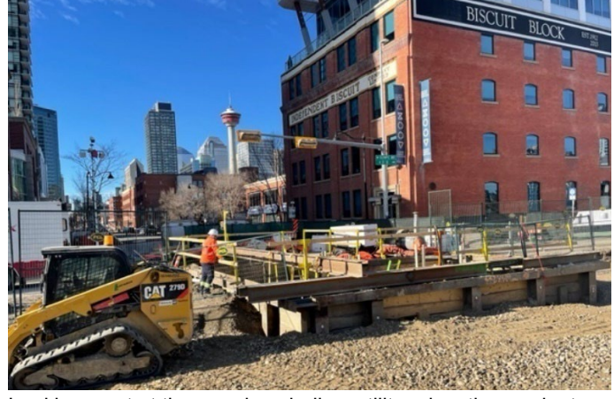
Looking west at the ongoing shallow utility relocation work at the intersection of Olympic Way S.E., and 11 Avenue S.E.

The following tables summarize utility relocation works that continued throughout the month of October, with a look ahead at planned construction activities for the month of November: