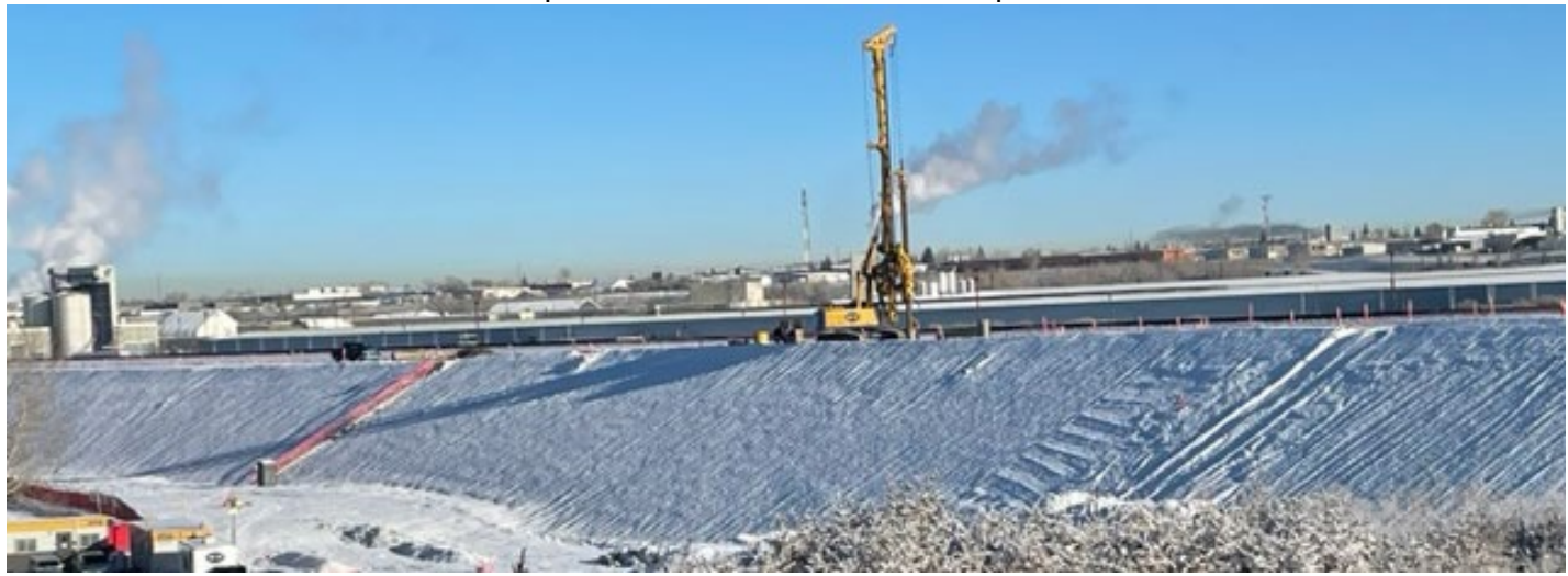
Looking east at the completed 78 Avenue diversion track embankment.

October was critical month for completing weather-dependent embankment construction work and Green Line worked with the contractor on an accelerated plan to expedite work by engaging another gravel pit and doubling the daily production and laying of gravel. As a result, the diversion embankments at 78 Avenue and the Pedestrian Tunnel area were completed at the end of October as planned.