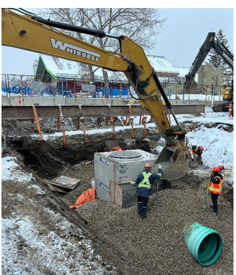
BDURP work in Beltline East.

Excavation work has begun on the original CPKC embankment at 78 Avenue. This excavation includes installing tie backs to the secant pile wall to secure the embankment during the installation of the 78 Avenue underpass structure. Further north, at the location of the future Ogden Station, work began in February to prepare for the installation of the CPKC diversion tracks which is expected to begin in March.