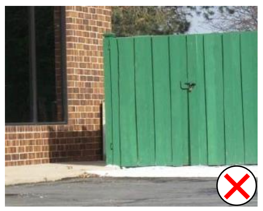
Screening should be compatible with the building, rather than draw attention to the screen.