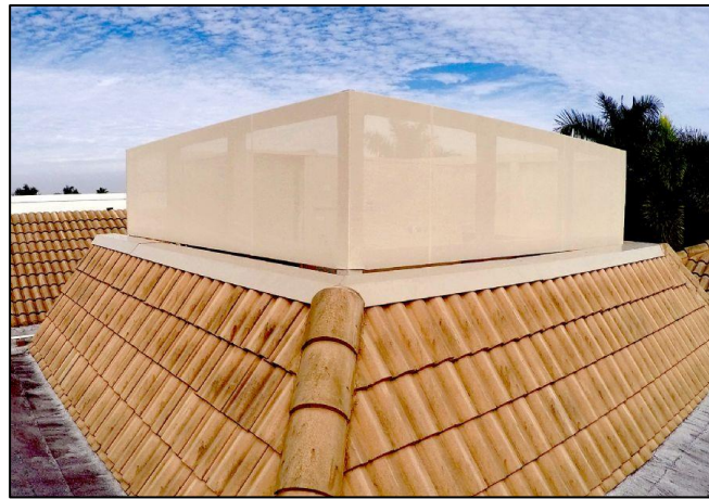
that is consistent with the building form and finish.