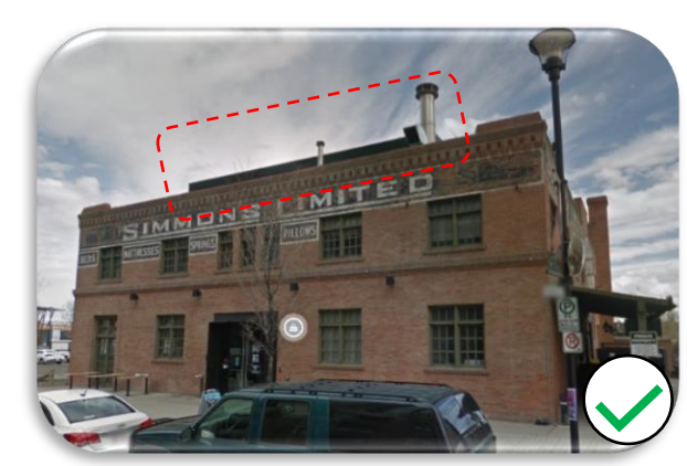
Equipment is partially screened, and partially exposed in a way that is harmonious with the building.