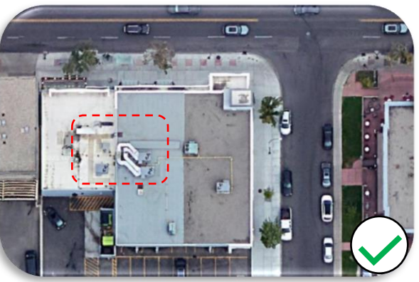
Equipment is located central to the rooftop, not visible from public spaces, houses or apartments.

Screening can take many forms, including; architectural (parapet), decorative, landscape, heavy duty, and light (screens made from awning material, etc.). Screening materials should be compatible with the building architecture (materials, colour, and scale) and with the surrounding landscape.