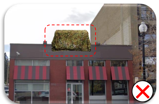
The attempted camouflage is not harmonious with the building and does not conceal the equipment.