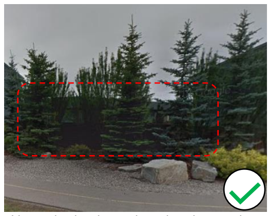
Vegetation has been planted to obscure view of equipment from the pathway.