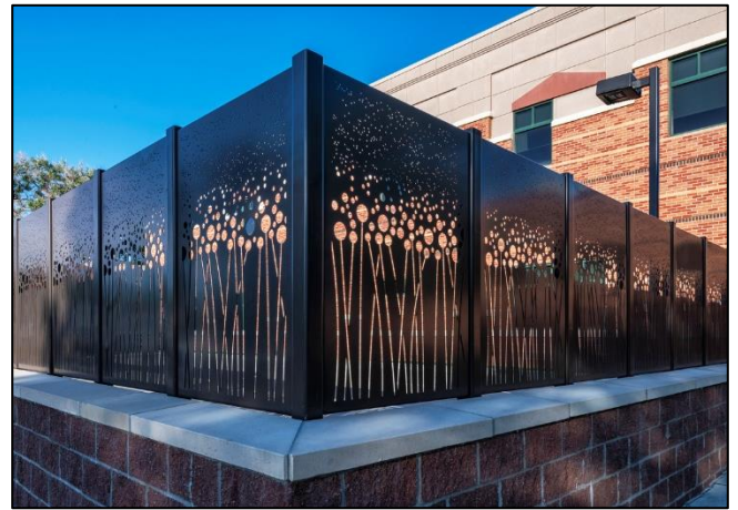
Decorative metal screening of at grade mechanical equipment. Screening of rooftop equipment with coloured awning fabric