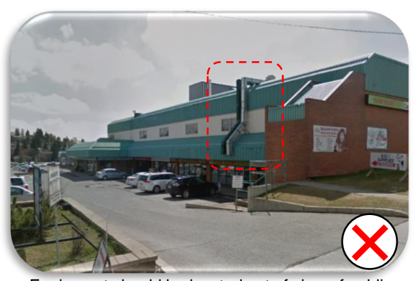
Equipment should be located out of view of public spaces, otherwise camouflaged or screened.