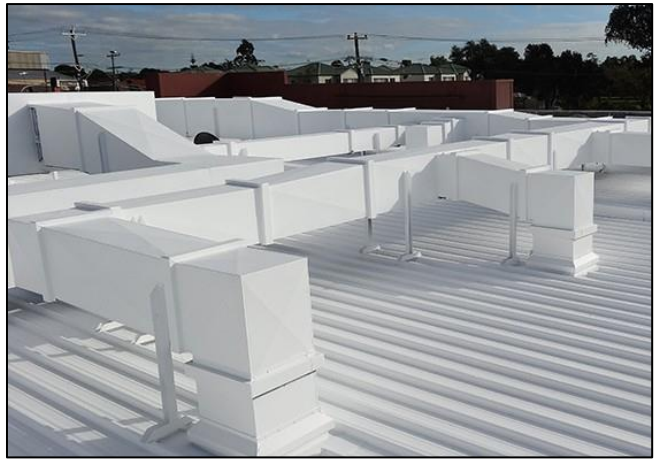
Camouflaging of rooftop equipment by painting the venting with a colour that is harmonious with the roof.

Why do we regulate mechanical equipment? Mechanical equipment typically has an industrial appearance that can disrupt streetscapes. Screening limits the negative visual impacts of equipment on residences, as well as public spaces.