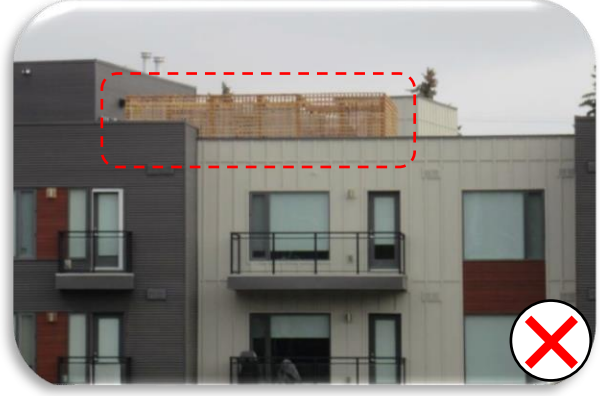
Screening should blend into the building design, rather than draw pedestrians' attention to the screen.