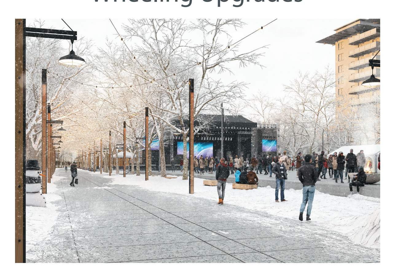
Eau Claire Plaza