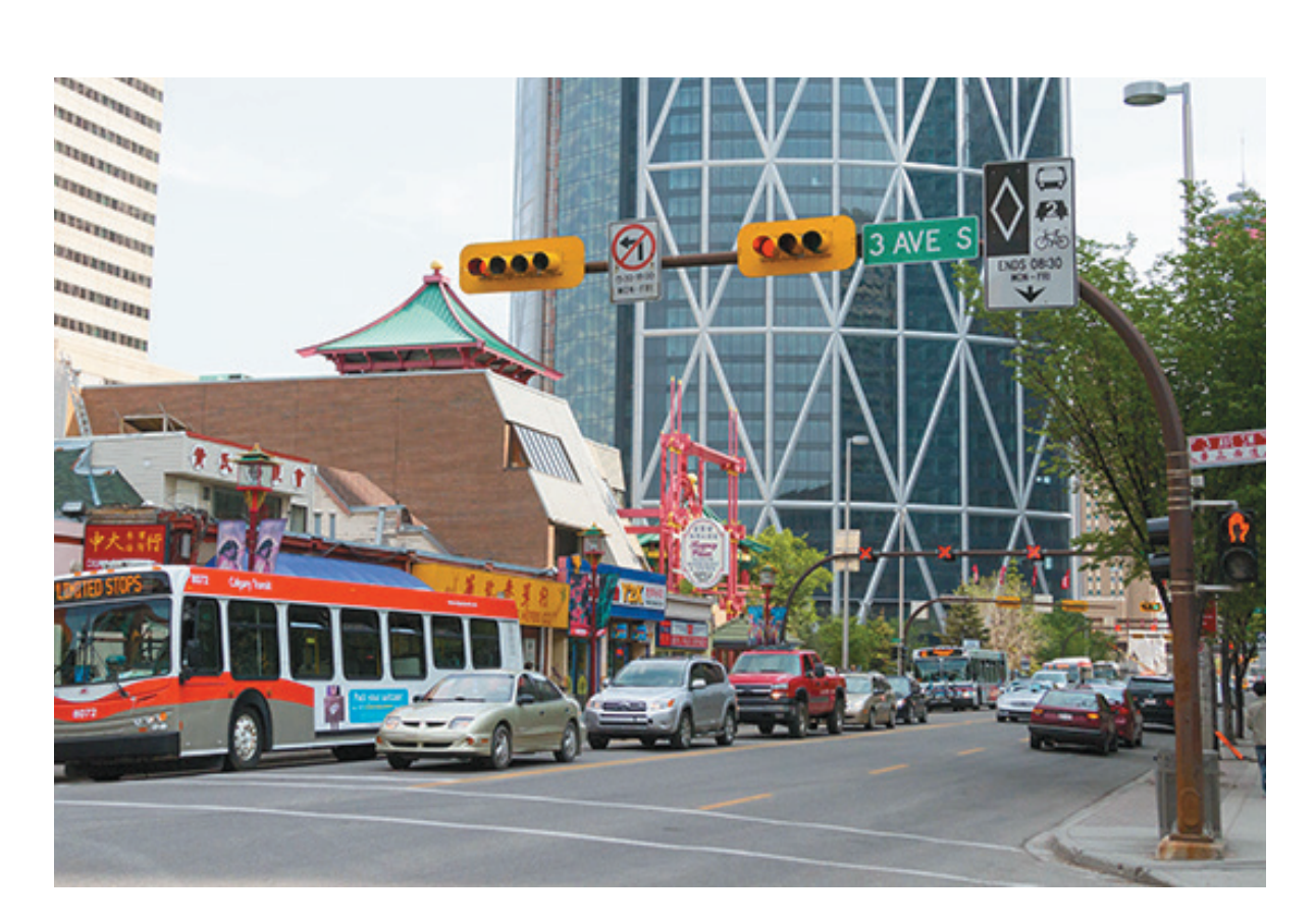
3 Avenue S. Walking and Wheeling Upgrades