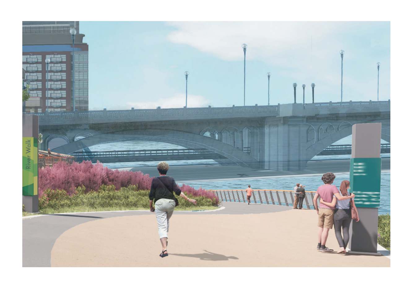
Centre St. Ramp Upgrades