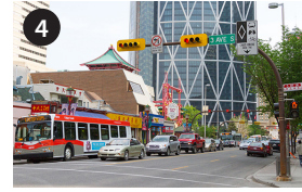
4 3 Avenue S. Walking and Wheeling Upgrades