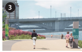
3 Centre St. Ramp Upgrades