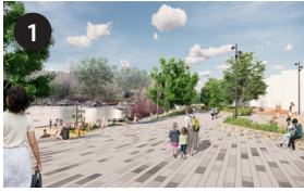
1 Downtown Flood Barrier and Eau Claire Promenade