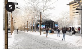
5 Eau Claire Plaza