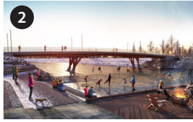
2 Jaipur Bridge Replacement