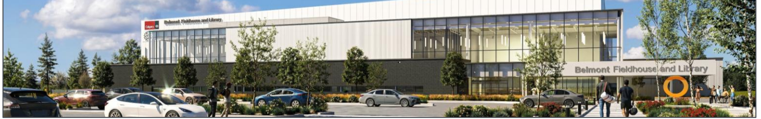
*Rendering credit: GEC Architecture