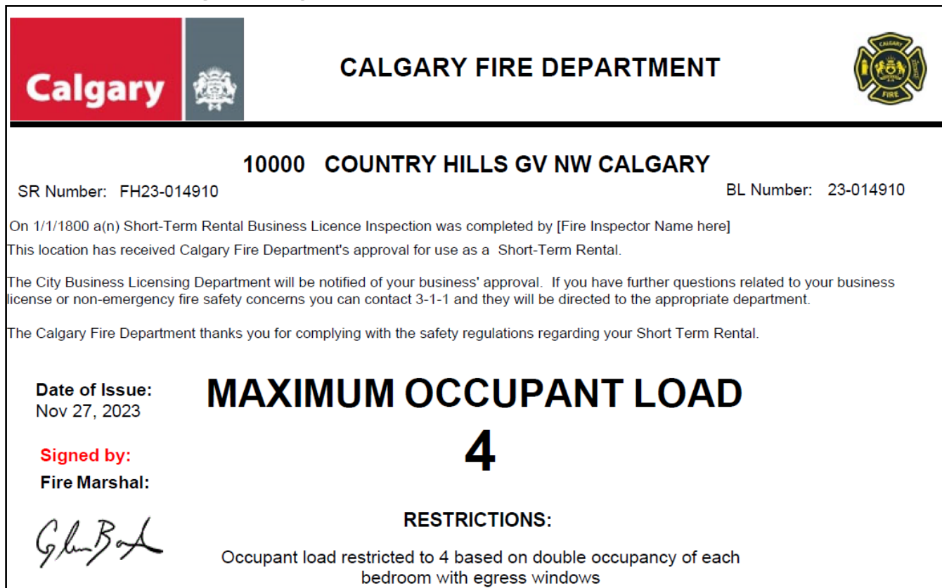
Figure 2 Sample Occupant Load Card (Issued after passing fire inspection)