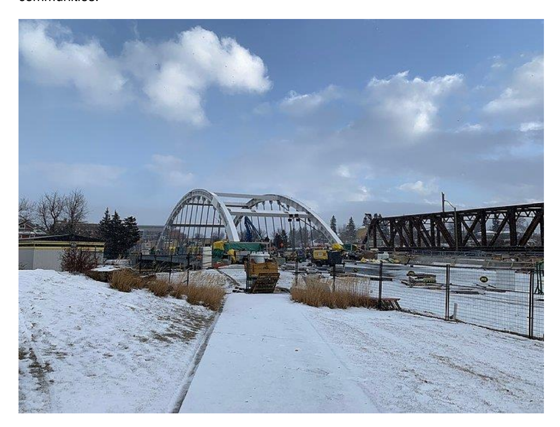
Progress on the 9 Avenue S.E. bridge.

See below for important updates on projects in and near the Inglewood and Ramsay communities.