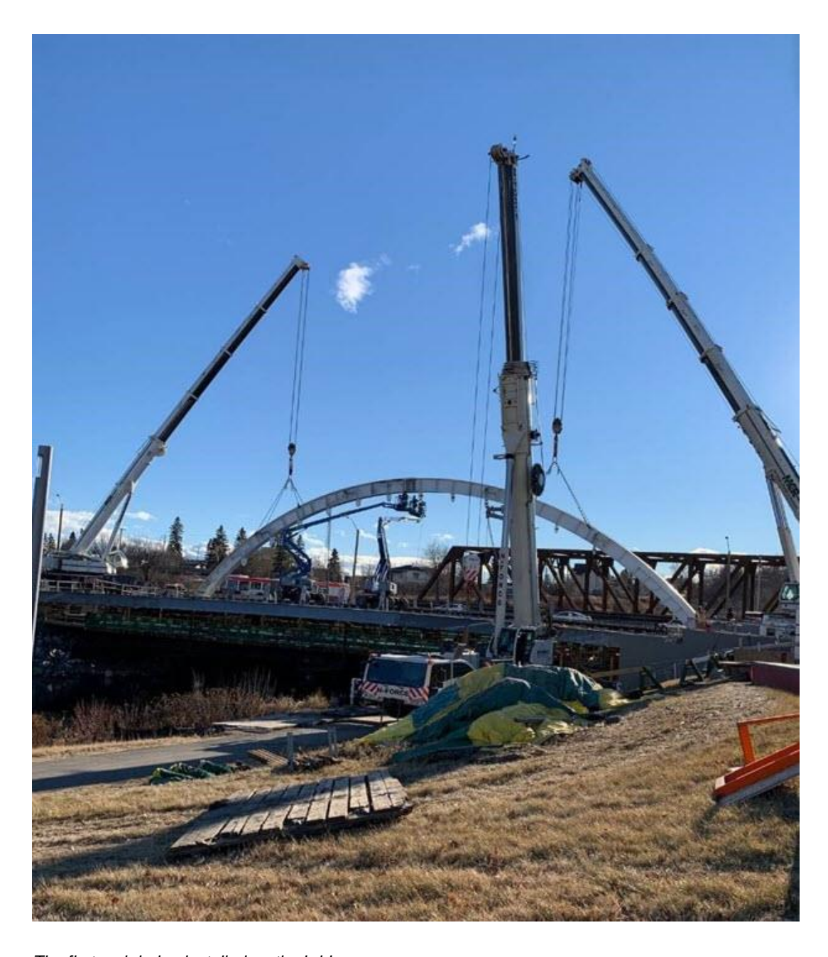
The first arch being installed on the bridge.