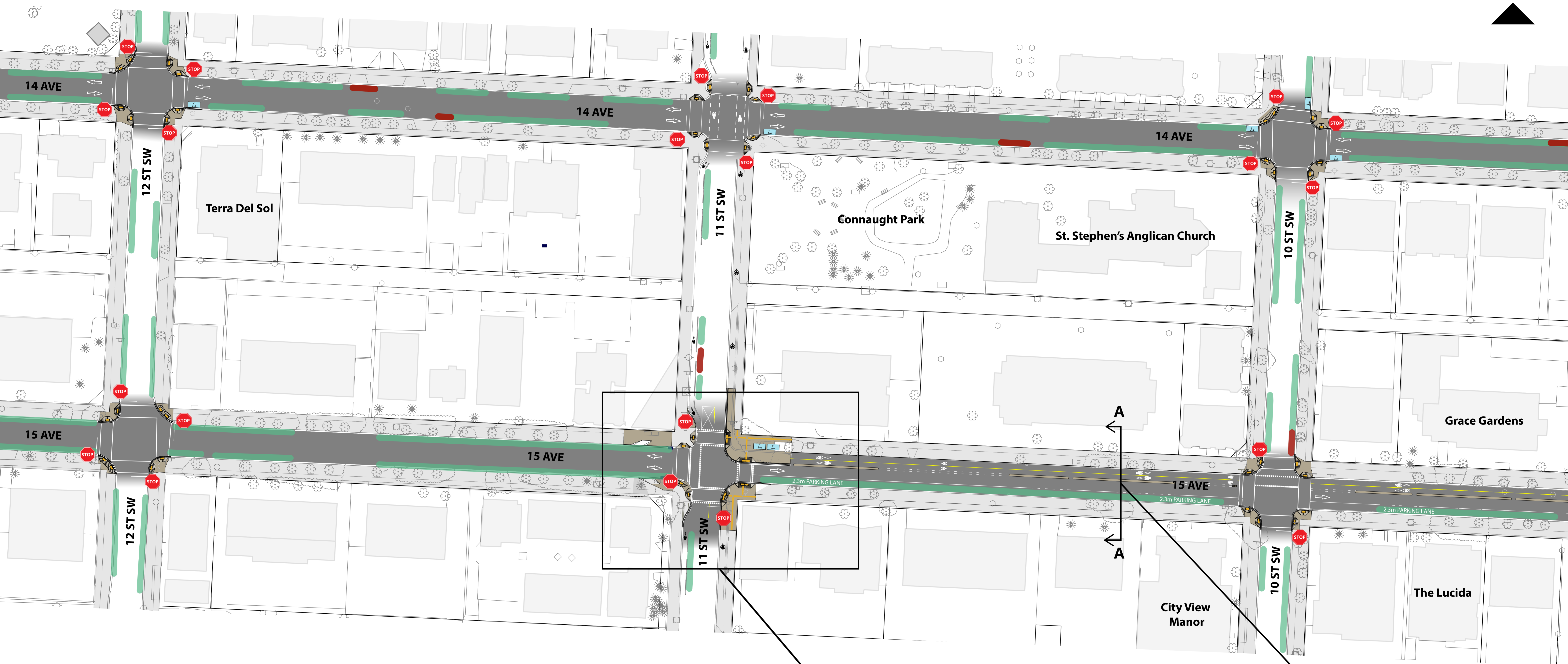
15 Avenue & 11 Street SW