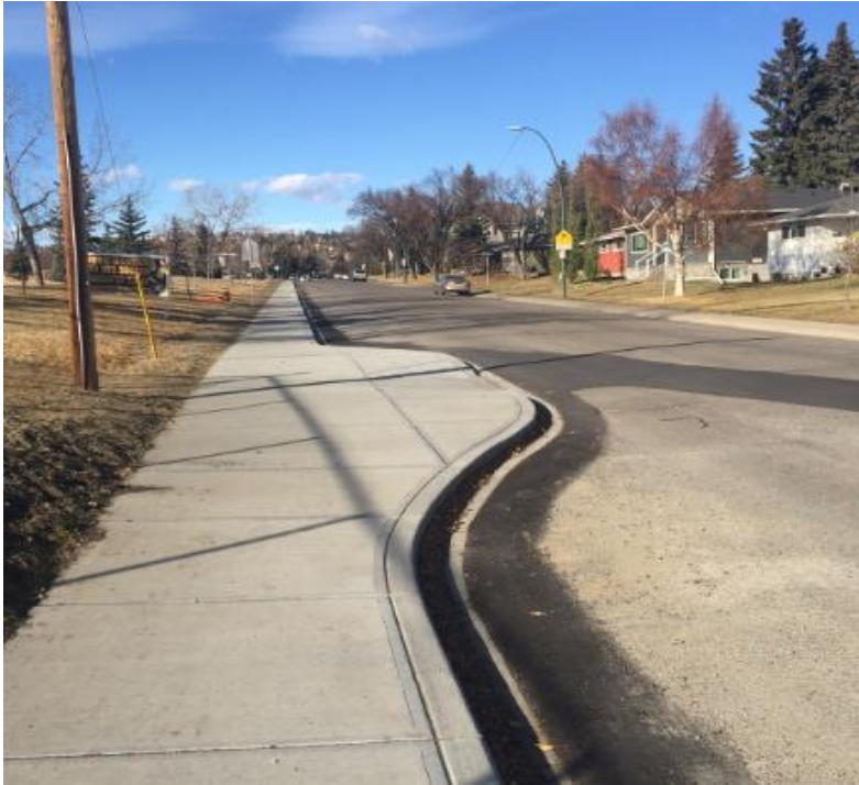
Example of a permanent curb extension: 8 Avenue and Westview Drive SW