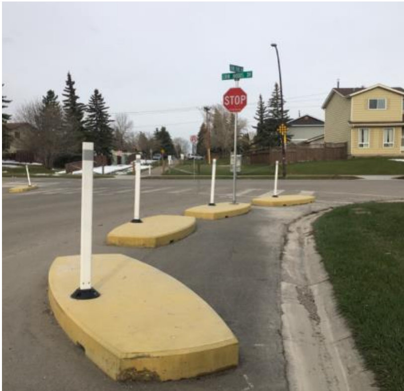
Erin Woods Drive and Erin Park Drive S.E.