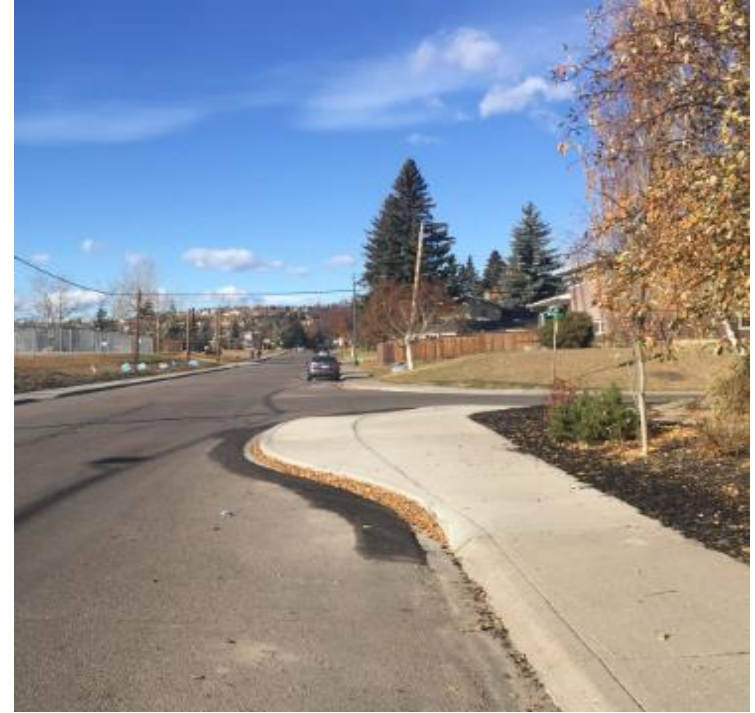
Example of a permanent curb extension: 8 Avenue and Warwick Drive S.W.