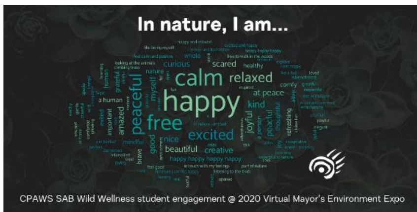
3 Example of a word cloud generated by students via Menti at the 2020 Mayor's Environment Expo

Based on teacher feedback from both 2021 and 2022's virtual sessions, lecture style sessions will not be approved.