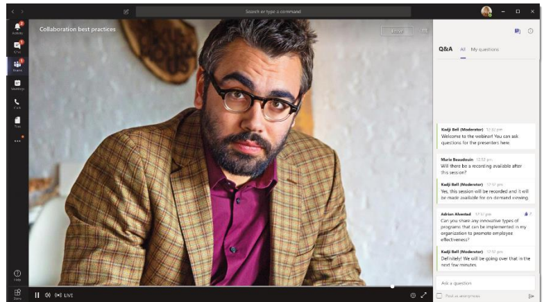
2 Microsoft Live Event example from Microsoft

Attendees will have the option to use the Q&A during the session if the function is turned on by the host, and some hosts may also invite attendees to use a third party polling service such as Menti, Jamboard, or Slido.