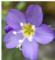
Showy Jacob's Ladder