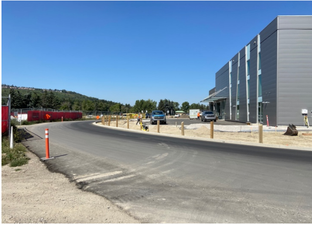
Looking west at fresh pavement on Montgomery View N.W.