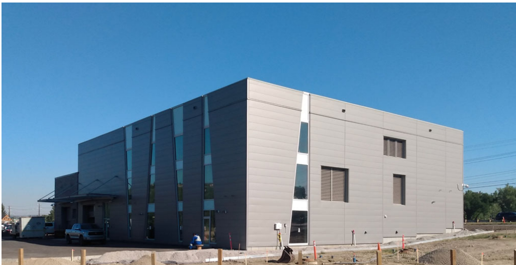
Looking northwest at the completed exterior

Over the last few months the building exterior has been completed. Inside the building, start-up testing on the facility's systems and equipment has been ongoing and is nearly complete. The equipment testing was noisy at times and we want to thank park users and nearby residents and businesses for their patience during this important work.