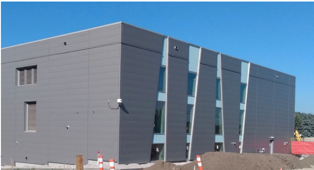
Looking at the north face of the building visible from Bowness Road N.W.