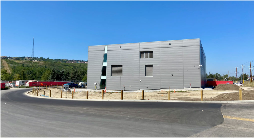
Looking west at Montgomery View N.W. and the pump station building