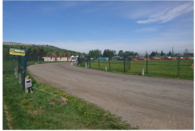
Throwback to Montgomery View N.W. in 2019