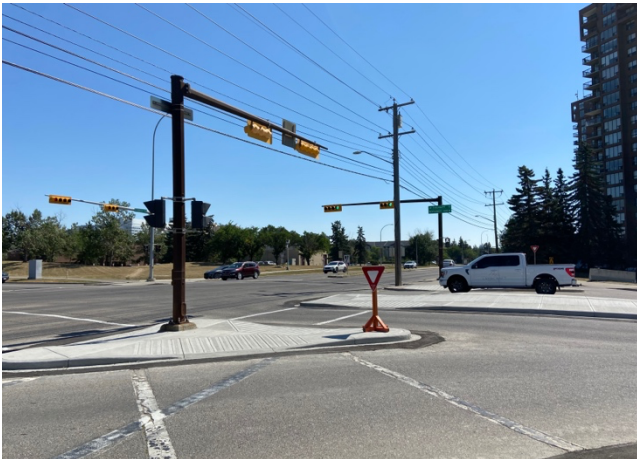
Looking east at the new medians at the Shaganappi Trail & Bowness Road / Montgomery View N.W. intersection