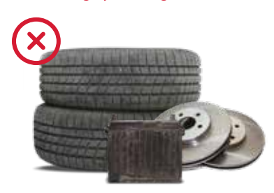
No automobile waste (ncluding car parts, tires and batteries)