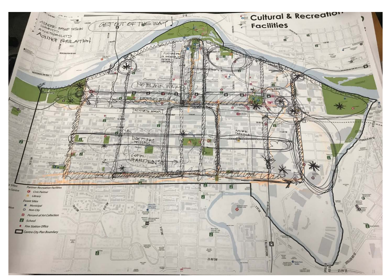
Figure 3 Mapping feedback from Table 3

See Figure 3 for the mapping notes that were provided by the attendees at table #3.