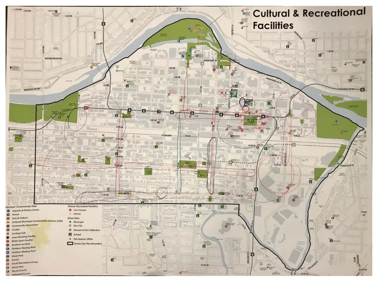
Figure 2 Map notes generated during Activity # 4 discussion